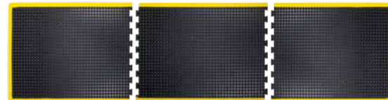
SDL864 - End